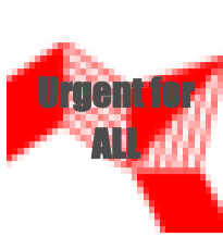
URGENT for Potential Grads + Due Dates