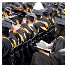
Graduation Information Video in Big Blue Button