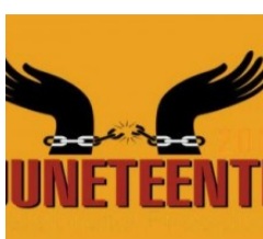
Juneteenth Today—No Live Sessions